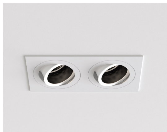
CODE: 1434005 FINISH: MATT WHITE

TO MAINTAIN THIS PRODUCT TO ITS BEST CONDITION, PLEASE VIEW OUR CARE AND CLEANING GUIDE ON THE SUPPORT SECTION OF THE ASTRO WEBSITE.