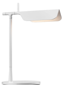
Table lamp. Body in painted pressofused aluminium. Multi-led diffuser in specially designed PMMA to avoid the Multi Shadow effect and dazzle. Head rotation \pm 45^\circ .