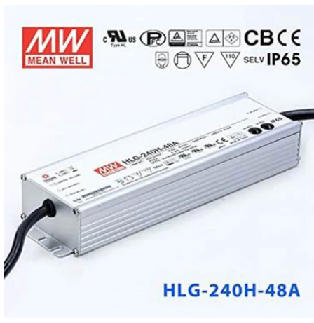
RF27617 HLG – 240H – 48°