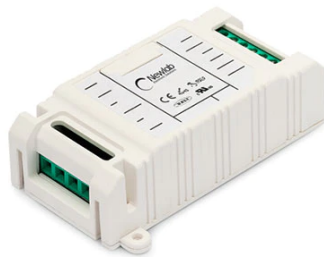
RF26994 Dimmer Led