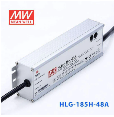
RF29209 HLG – 185H – 48A