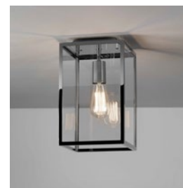
CODE: 1095022 FINISH: POLISHED NICKEL

TO MAINTAIN THIS PRODUCT TO ITS BEST CONDITION, PLEASE VIEW OUR CARE AND CLEANING GUIDE ON THE SUPPORT SECTION OF THE ASTRO WEBSITE.