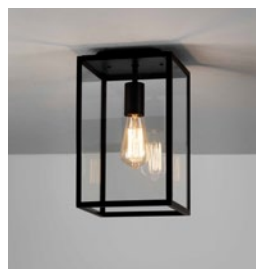
CODE: 1095021 FINISH: TEXTURED BLACK