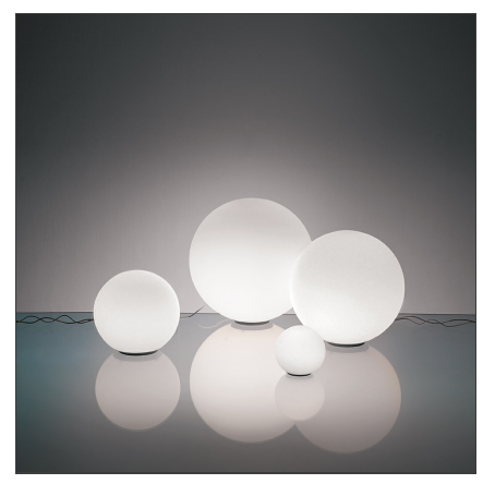
IP20 □ 🕸 c€