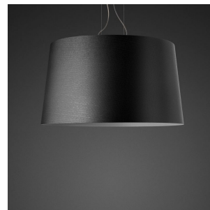
Twice as Twiggy